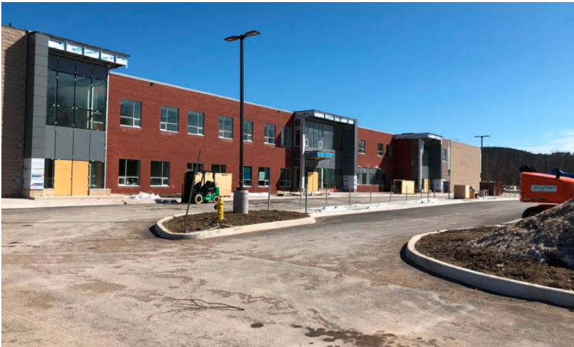
Georgian Bay Community School build project